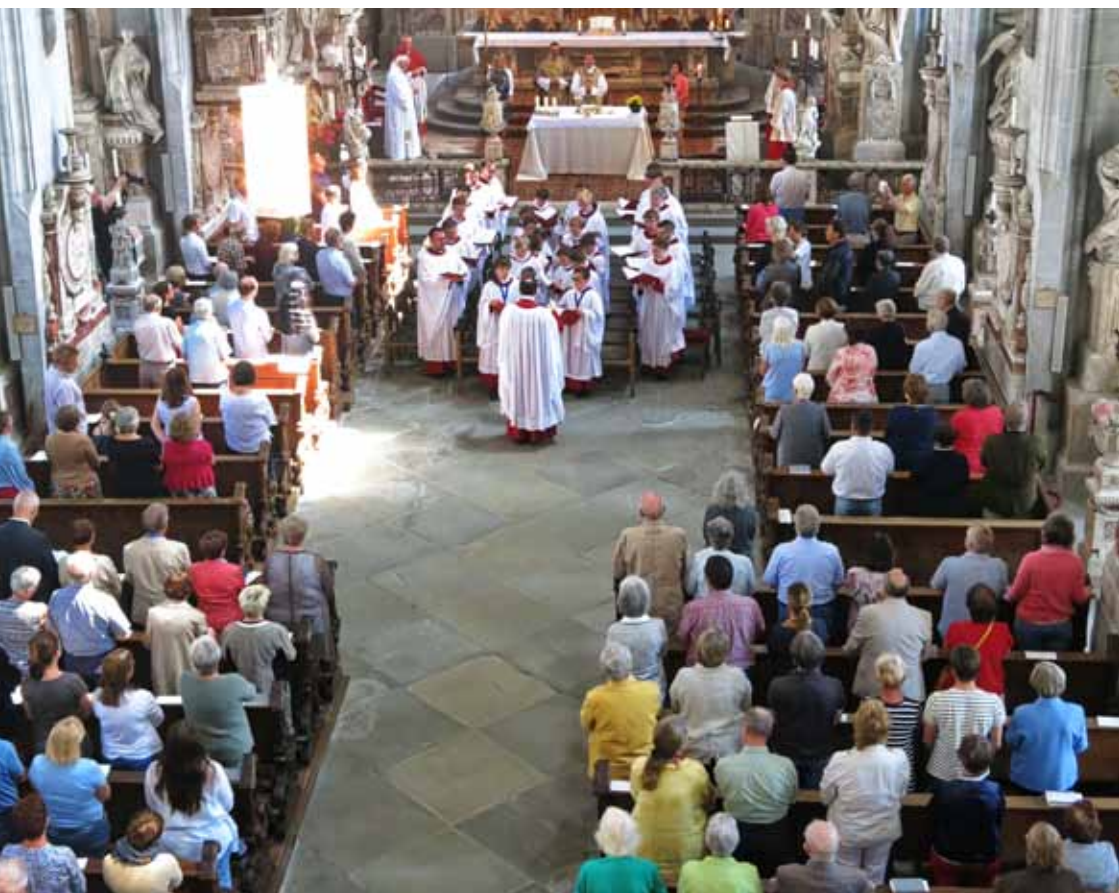
Truro Cathedral Choir singing in Salem Minster, Germany, June 2017