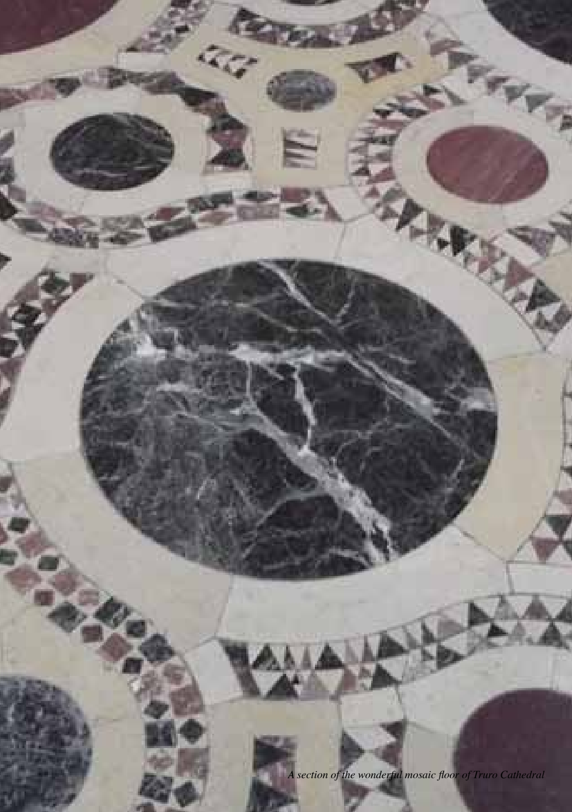
A section of the wonderful mosaic floor of Truro Cathedral